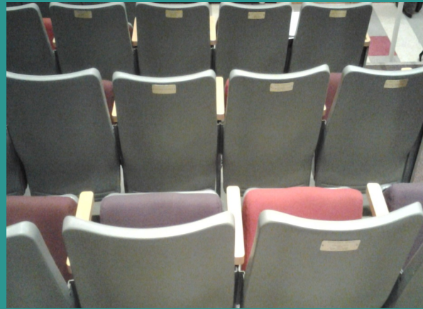
Plaques are attached to the backs of seats.

When you Have a Seat , you support the Orion's mission and are a part of the action. Your name on a brass plaque (or two!) shows your enduring commitment to the arts and to arts education. (It does not guarantee your seating there for performances.) Please fill out the form on reverse and mail your check to OPAC, 50 Republic Ave, Topsham, ME 04086.